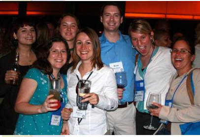
Undergrad alums catch up in San Diego

For more information, contact Karen Myers at myers@comm.ucsb.edu